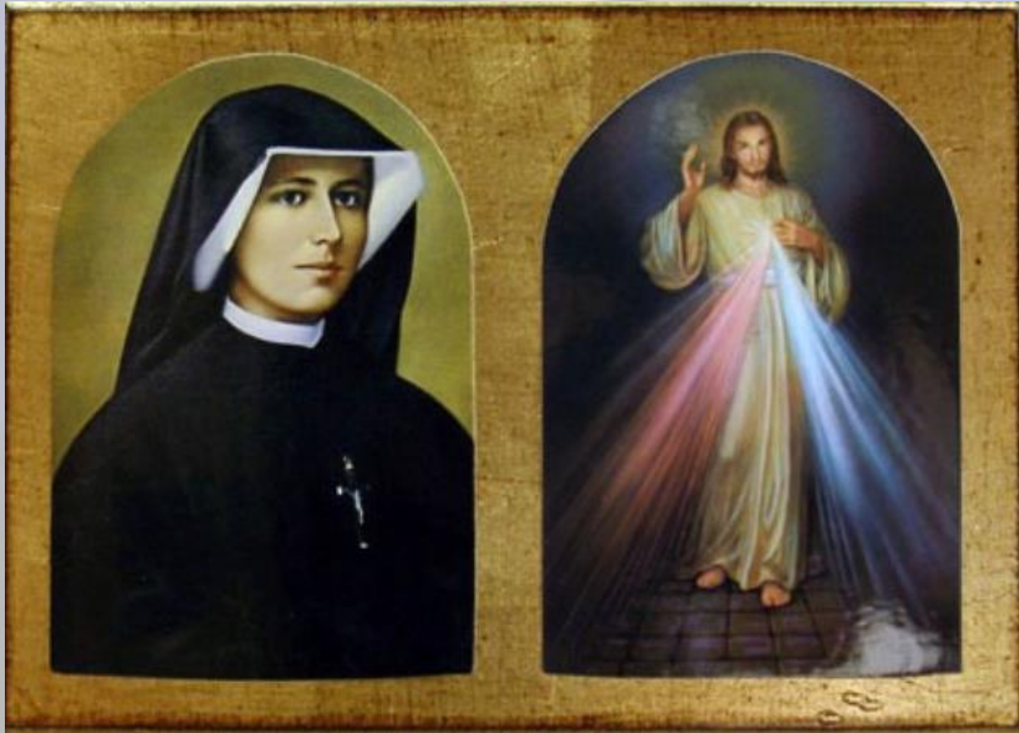
St. Faustina Kowalska the Apostle of Divine Mercy. (1905 ~ 1938)